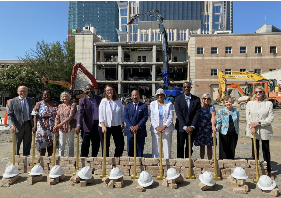
Demolition of Current Main Library August 15, 2023