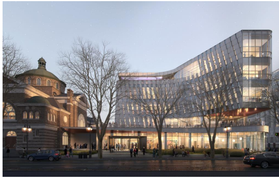
New Main Library Opening Spring 2026