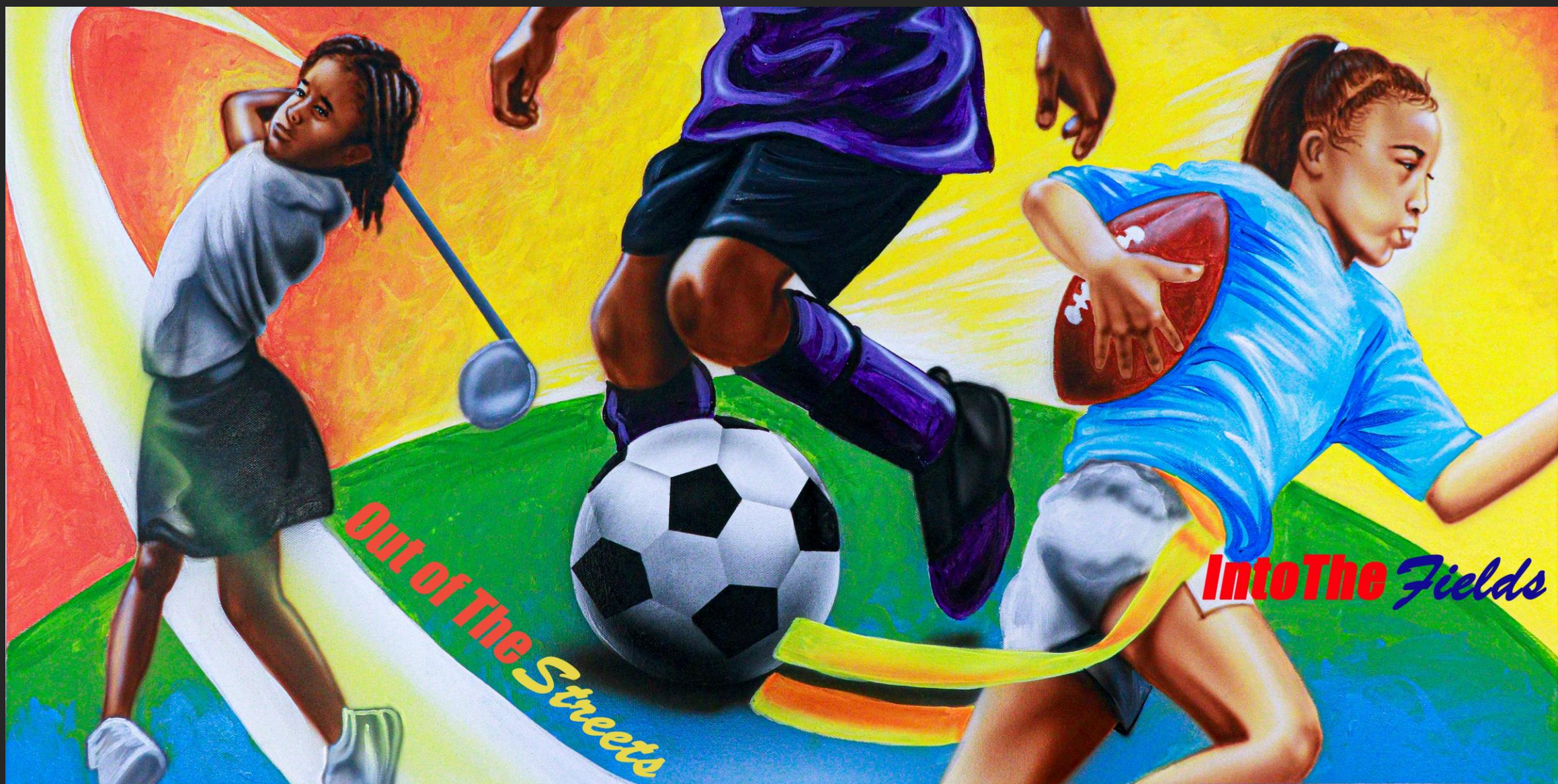
Out of the Streets, Into the Fields by Abel Jackson