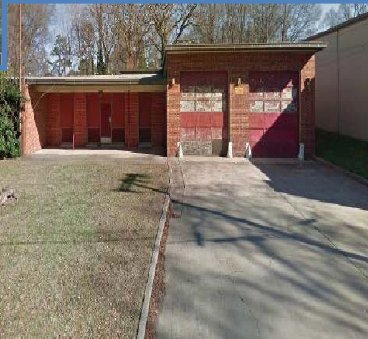
Former Fire Station 10