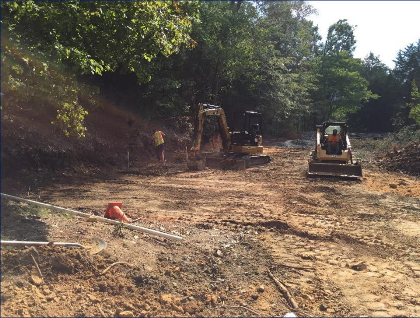
Rough grading for new parking lot