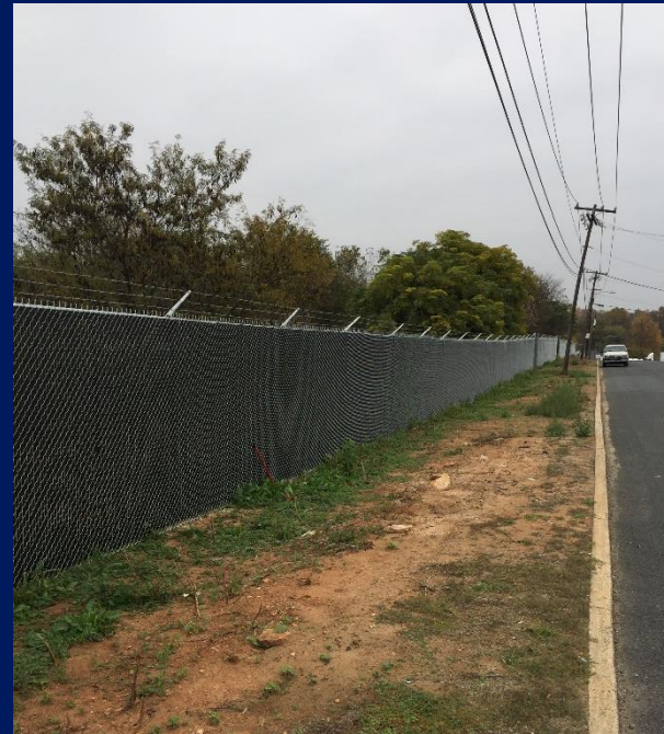
After: Installation of 2100 feet of new fence