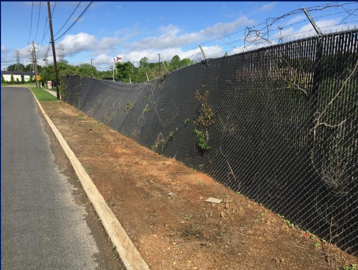
Before: failing fence structure