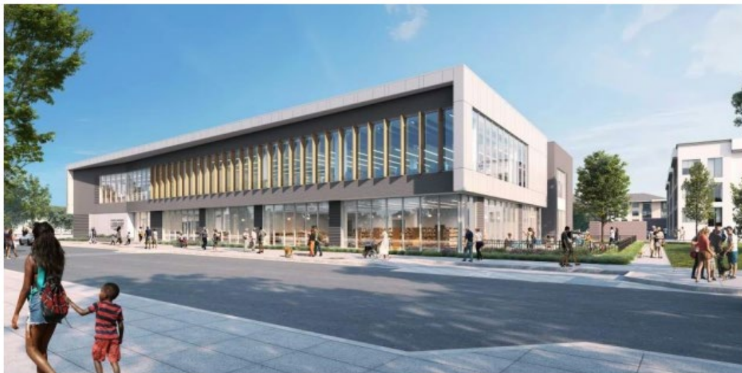
New University City Regional Library Opening 2025