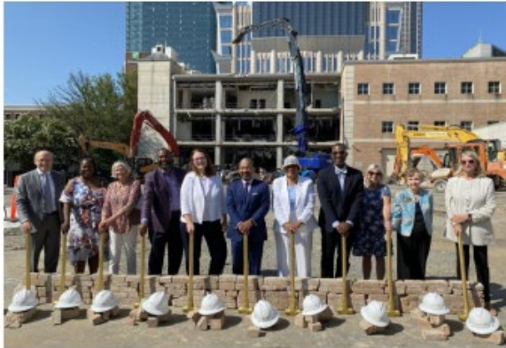
Demolition of Current Main Library August 15, 2023