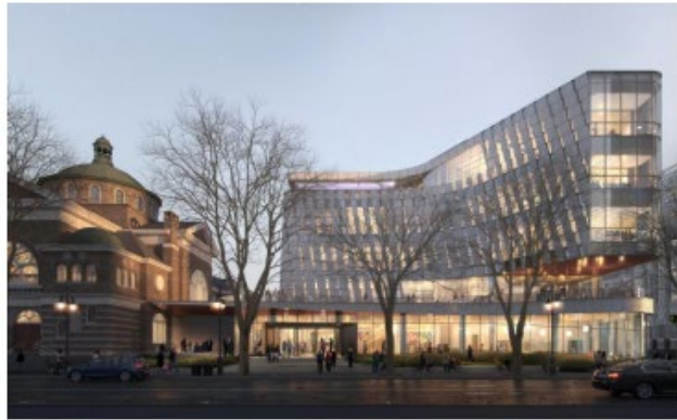
New Main Library Opening Spring 2026