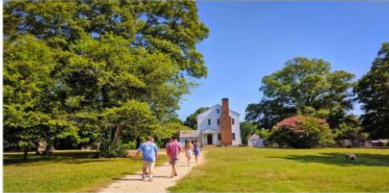
Visitors walking towards historic structures at Latta Place, provided by The Design Minds, Inc.