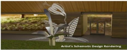
Artist's Schematic Design Rendering

Location: 6220 Park Rd District: County – 5; City – 6 Art Budget: $70,173 Project Scope: Free-standing sculpture Media: Stainless steel Category: Park and Recreation Status: Final Design Anticipated Install: July 2025 Project Managers: Randella Davis