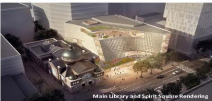
Main Library and Spirit Square Rendering

Description: The artist will create freestanding artwork/s to be sited in a designated space between the vehicular roadway and the greenway trail. This location will be highly visible to vehicular traffic and pedestrians. The artwork will serve as a wayfinding element, acting as an unofficial trailhead to the Long Creek Greenway Northlake Parkway Centre entrance.