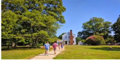
Visitors walking towards historic structures at Latta Place